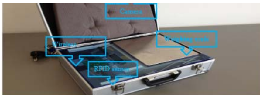
Figure 1. DIMS 2.0 for measuring before and after meal consumption photos and weight of plate contents